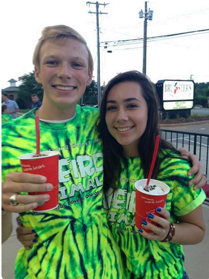
Milkshakes after VBS 2014